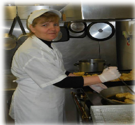
Figura 1 Making diplas traditional greek sweet