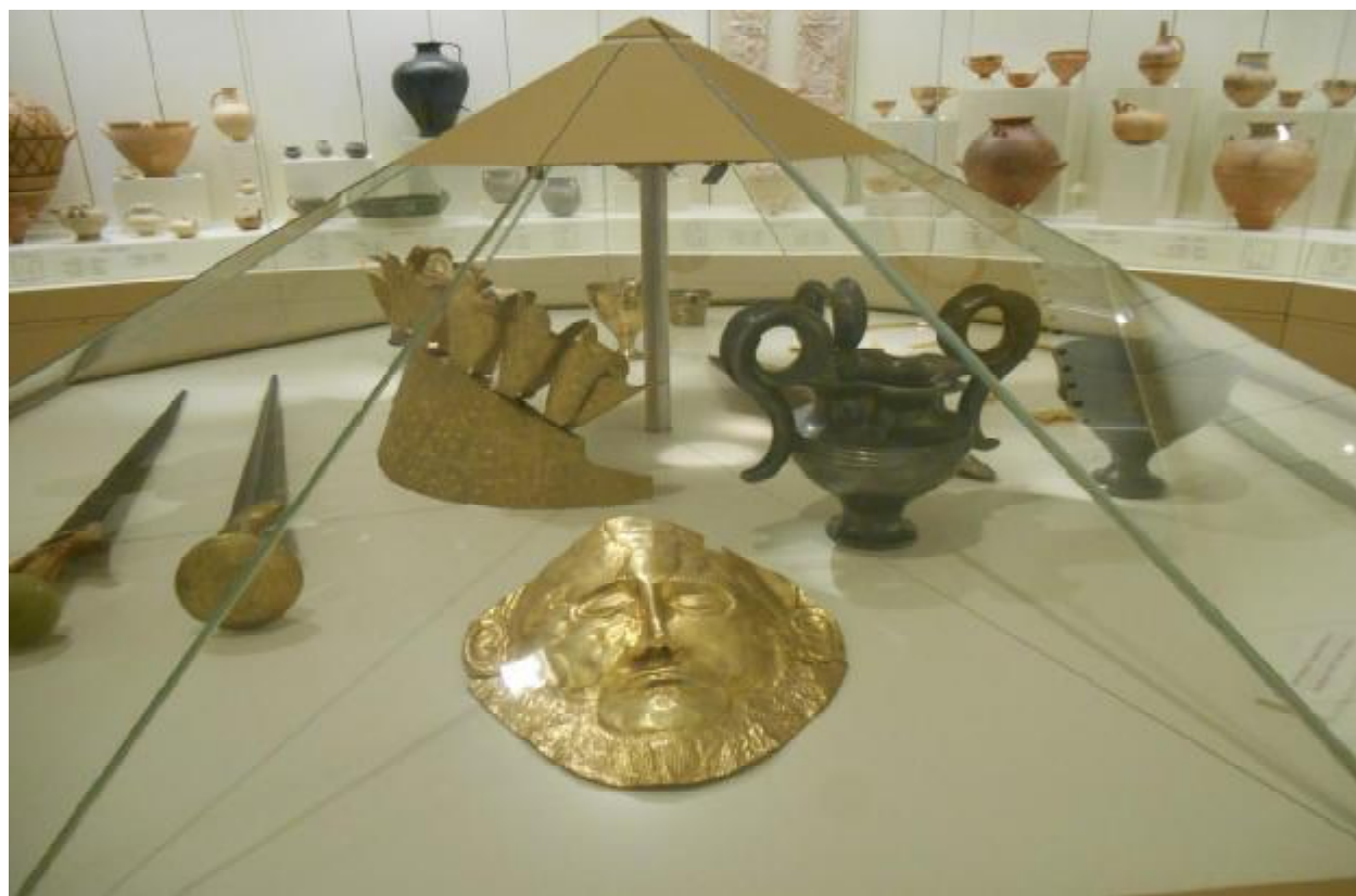
Figura 3 THE GOLD MASK OF AGAMEMNON

http://odysseus.culture.gr/h/3/gh351.jsp?obj_id=2573